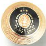
AG3327 10/15/17.8/19/ 20/22.6mm