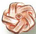
AG 4376 17mm