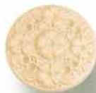
AG 2669 13/16.5/20.3/24.1/30.5mm