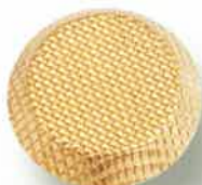
AG 3503 15/17.8/20.3/22.9mm