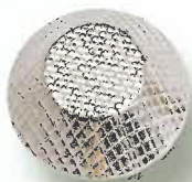
AG 3925 18/21mm