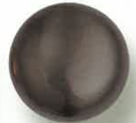
LG 8228 18/20/23mm