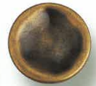
LG 8107 22mm