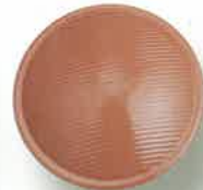
LG 8027 15/18/23/25mm