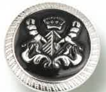
AG3313 18/20.3/ 23/25mm