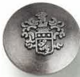
AG 2395 10/15.2/17.8/20.3/22.9/25.4/28mm