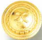
LG 8036 18/23mm