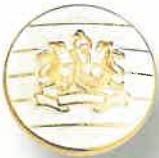
AG 3514 13/15/18/20/28mm