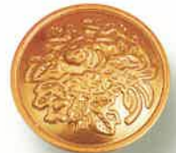
LG 8313 23mm