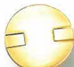
AG 4248 15/18mm