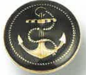
AG 3312 15/20/22.9/25mm