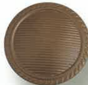
LG 8377 23mm