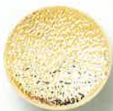
AG 4136 15/20/22.9mm