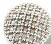
AG 4218 SIZE: 20.9mm