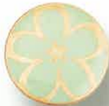
LG 6035 20mm