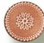
LG 8327 18mm