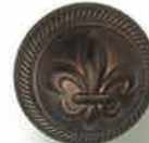
AG 2851 15/17.8mm