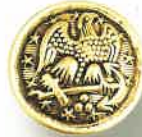
LG 8409 18/23mm