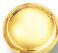
AG 3325 18/20/22.9/25/30mm