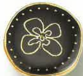
AG 3260 18/20mm