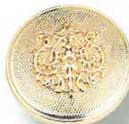
AG3509 15/17.6/20/ 22mm